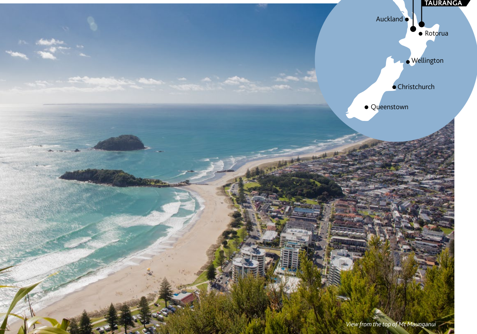
View from the top of Mt Maunganui

Find out more about Tauranga and the Bay of Plenty region at bayofplentynz.com