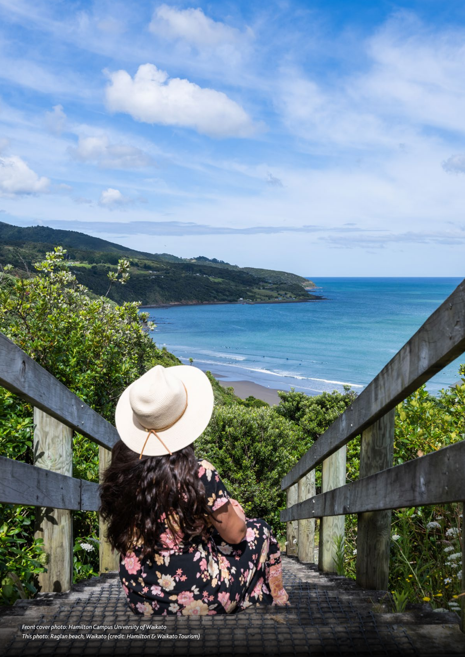
Front cover photo: Hamilton Campus University of Waikato This photo: Raglan beach, Waikato