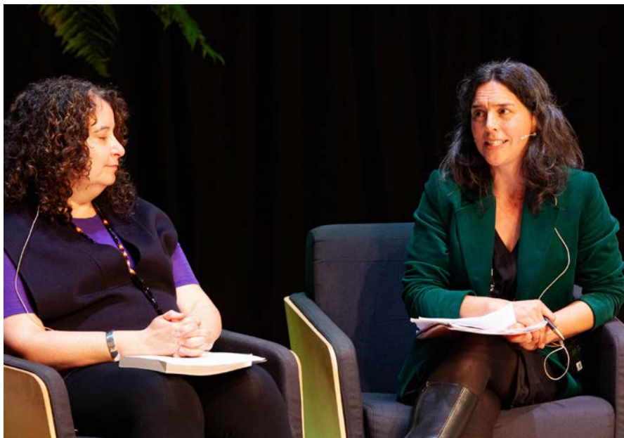
Image from Te Kāhui a Kiwa, conference, day two.

Well, I just want to thank you both for your amazing contribution to this whole work over many years but also for today. We have just been blessed with your presence and your whakaaro. Thank you very much on behalf of the conference.