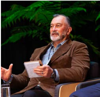
Image from Te Kāhui a Kiwa, conference, day two.

Another theme to emerge over the last couple of days is to place Papatūānuku and people ahead of profit. At the current time, it’s the other way around. It’s all profit driven.