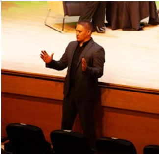
Image from Te Kāhui a Kiwa, conference, day one.