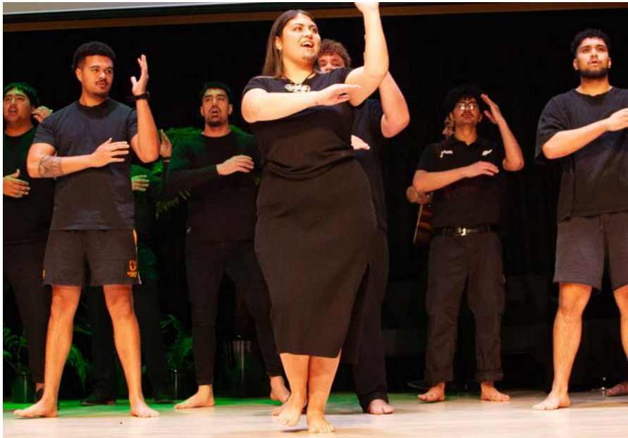
Image from Te Kāhui a Kiwa, conference, day one.

able to correct a stitch here or there and it will be even more beautiful. But thank you all for your attention this evening. Kia piki te ora, te kaha, te māramatanga, ki runga i a tātou katoa, nō reira tēnā koutou tēnā koutou, tēnā tatou katoa.