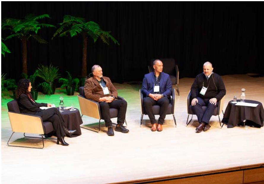
Image from Te Kāhui a Kiwa, conference, day one.