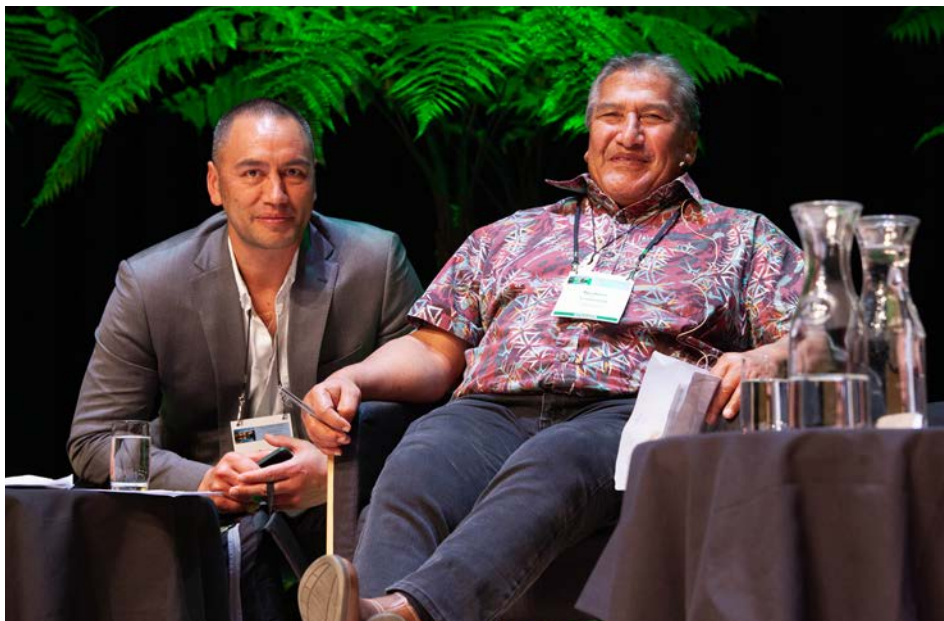
Image from Te Kāhui a Kiwa, conference, day one.