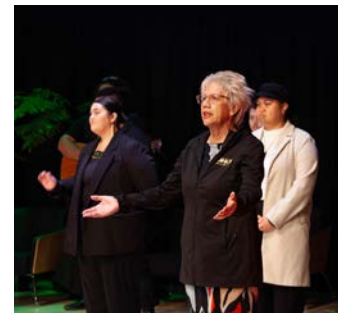
Image from Te Kāhui a Kiwa, conference, day one.