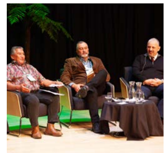
Image from Te Kāhui a Kiwa, conference, day two.