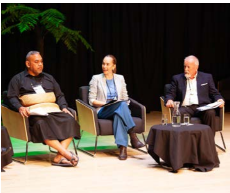
Image from Te Kāhui a Kiwa, conference, day two.

Mahalo for coming to this session. Thanks for supporting us. No pressure. I was feeling a little pressure back there after that introduction. I'm really encouraged though, because I'm up here with a fantastic panel. So, as you heard, through my mother I'm Kanaka Maoli, kanaka iwi. From the north shore of the beautiful island of O'ahu in the beautiful islands of Hawai'i. Through my dad, I am Cherokee from Bohannon mountain in Northwest Arkansas, and I also have some Choctaw heritage and some other things. So, my tāne of 30 years is also Ngāti Poata, Ngāti Kuia, Ngāti Toa Rangatira, Kai Tahu. We have five mokopuna now, so four kids and four mokopuna now, and a couple of them are Samoan too. So, I bring that up, because we have these long and—as was raised yesterday—we have these long and old and beautiful heritages and whakapapa and whakawhanaungatanga that connects us. That's represented in this room and in this panel as well.