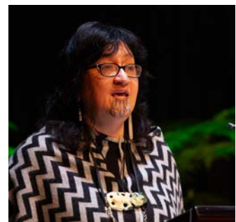
Image from Te Kāhui a Kiwa, conference, day one.

E te rangatira i pūpuri i te mauri o tēnei whenua rangatira o Ngāti Wairere kei te mihi atu au e te Pāpā ahakoa kei te haere atu koe, kei te pai i whakaarohia i te whakarongo