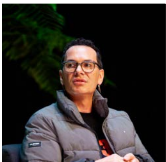
Image from Te Kāhui a Kiwa, conference, day two.

I often think about the unsung heroes when I think about the business that I'm involved in. The business that I'm involved in, of course, is Māori language broadcasting, and iwi radio was the tuakana, or the senior, of all the different siblings that make up the Māori broadcasting family. That whānau of Māori broadcasting includes 21 iwi radio stations, it includes Māori Television, Whakaata Māori, and it includes the family or whānau of Māori production companies that create content. When we think about content, I'm talking about digital content. So our journey over the last 30 years as an iwi radio station, it serves as a monument to those that fought hard and continue to fight hard in the critical Māori rights movement. I hark back to the 1970s, to the 1990s. Our iwi radio station was established in 1991. There were those that were earlier than us. The vision of our old people was to ensure that our language was not just an academic experience, but it continued to be a method of communication. So that as part of the value and