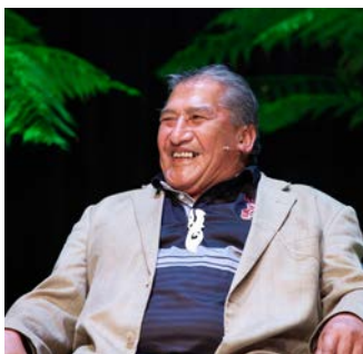
Image from Te Kāhui a Kiwa, conference, day one.

of whakapapa. People would yell at each other on the paepae, they would yell at each other at the hangi pit, but at the end of the day they all got on. And when we look beyond Aotearoa because I brought up at a marae called Waipatu and even though we were only 2km from the centre of Hastings, I was brought up in a total Māori environment. The only pākehā I saw was the doctor, the nurse, and the Sunday school teacher. So, very much Māori, and I wanted to know how our parents and our uncles— without any vehicles or anything— how they knew every Māori in the country. Our local hapū was Hawea, and so this is where it all begins and ends. No, no. We're part of Whatuapiti from Whaingaroa to Te Whakatau. Oh, suddenly we own half of Hawke's Bay. No, no, we're part of Kahungunu, it goes from Wairoa to Wairarapa, here we have own half of the East Coast. Now we're part of Tākitimu, it goes from Ngāti Kahungunu, Tauranga right down east coast, all of the South Island. Now we own half New Zealand. There we go to Rarotonga. They say no, we're Tākitimu, and you come from Tahiti, Samoa, Hawaii, Fiji and Tonga. So now I own half the southern hemisphere. So, I was wondering how this whakapapa connection worked.