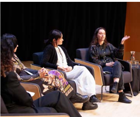
Image from Te Kāhui a Kiwa, confrence, day one.