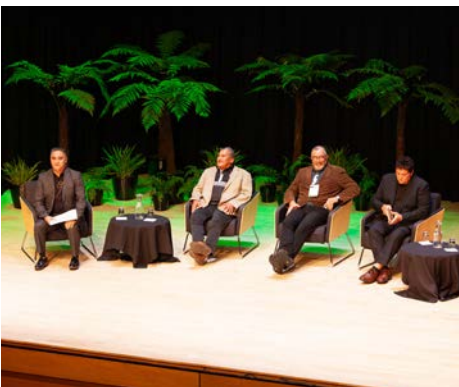
Image from Te Kāhui a Kiwa, conference, day one.

Look, I shouldn't be here. I left school in the 5th form. I went to the freezing works. From the freezing works, I went to the orchards and then shearing contractor, forestry contractor, fencing contractor, apple picker of renown. One of my best