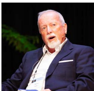
Images from Te Kāhui a Kiwa, conference, day two.

peoples to speak of. Of course, my father's peoples had the experience of having to concede a little more land, and a little more in every agreement that they made with the United States as well. So, we come to this pace in that sense, but I'm also mindful—and I think this is part of the real heart of this panel—that the word that we use in Hawai'i for the Pacific, that thing that covers 1/3 of the earth, the biggest thing literally on planet Earth that is at the heart of this agreement, covers 25 million square miles, the places where our people settled cover 25 million square miles. That thing for us is Moana-nui-a-Kiwea, it is the ocean of the great expanse. This panel has the opportunity to talk about that expanse, what it might be, and particularly for Māori, Pacific and Indigenous peoples. I'm really humbled by my panel. So, we've got some questions to keep us on track. I think very good questions. The first opportunity that I would like to give our panellist is the opportunity to introduce themselves, and as they do so, to answer these three questions.