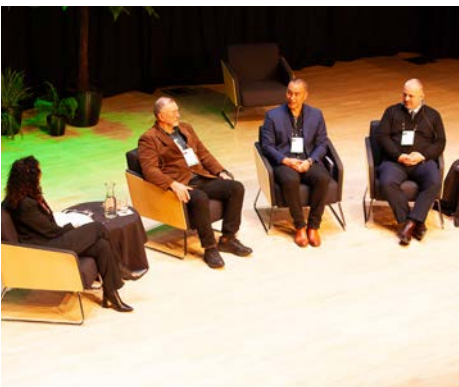
Image from Te Kāhui a Kiwa, conference, day one.

is Indigenous entrepreneurship, and Māori entrepreneurship, and thinking about Māori enterprises in terms of what makes them successful, what helps our Māori enterprises to grow and develop, and what kind of support that enables them to do that. Thinking about that, where are our Māori enterprises, they're in all sorts of sectors, they're sort of agribusiness, entrepreneurship, digital sectors, and they're also involved in Indigenous international trade. So, I've been really interested in sort of understanding what it is they do and how they operate, in terms of my research and all the sorts of mahi that I've been doing.