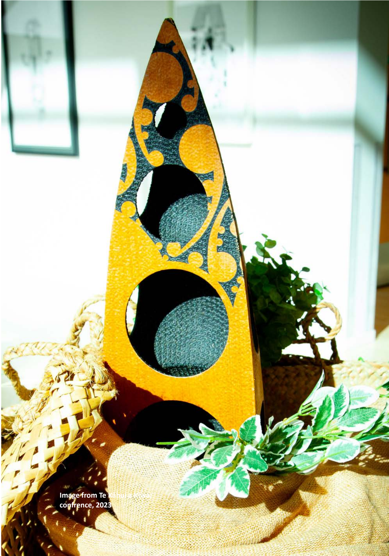
Image from Te Kāhui a Kiwa conference, 2023