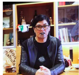
Image from Te Kāhui a Kiwa, conference, day one.