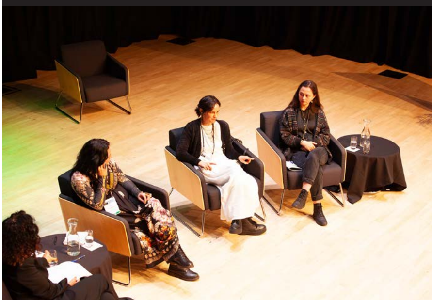
Image from Te Kāhui a Kiwa, conference, day one.