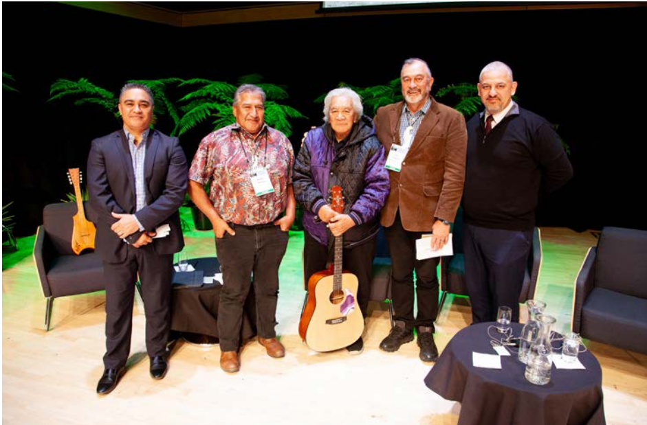
Image from Te Kāhui a Kiwa, conference, day two.