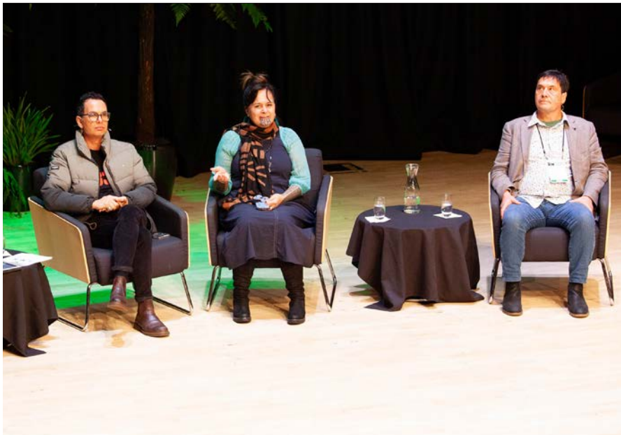
Image from Te Kāhui a Kiwa, conference, day one.