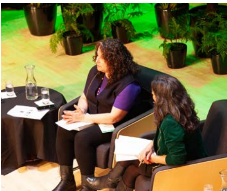
Image from Te Kāhui a Kiwa, conference, day two.