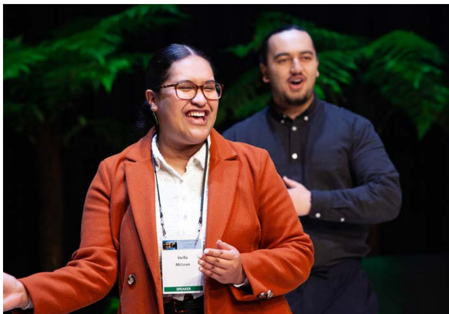
Image from Te Kāhui a Kiwa, confrence, day one.