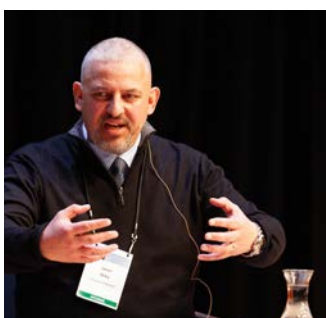
Images from Te Kāhui a Kiwa, conference, day one.