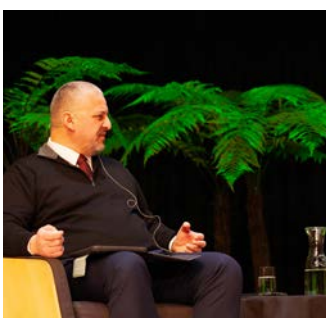
Images from Te Kāhui a Kiwa, conference, day two.

Toronto today is the worst in the world. I’m actually concerned about my parents, who are elderly, and my small dog, who I have left at home. It’s been like this off and on all summer, earlier than summer, because our summer started in May, usually May is just starting to get warm. This year, May was hot. And that’s why Canada is on fire. The smoke is affecting all the way to Europe, down to the United States. When it’s like that, I’m sure people from Australia know what it’s like, you can’t go outside. So, we’re stuck in our homes and the only nice weather that we get.