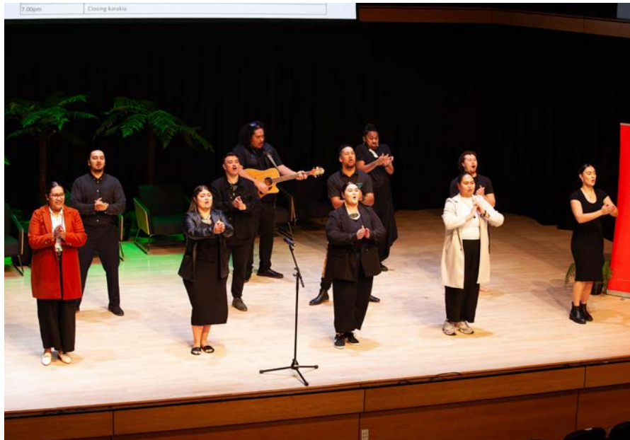
Image from Te Kāhui a Kiwa, confrence, day one.