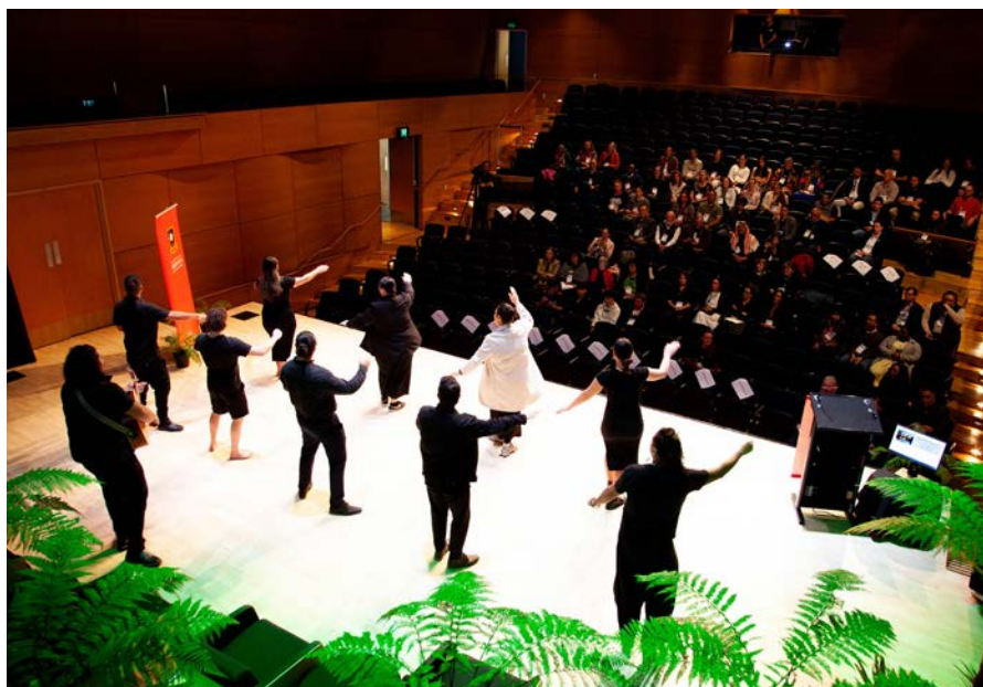
Image from Te Kāhui a Kiwa, conference, day two.