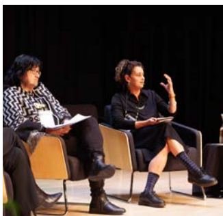
Images from Te Kāhui a Kiwa, conference, day one.

WAI2522 claim and out of a mediation, and it’s fair to say it’s a work in progress. It’s frustrating, frustrating, frustrating. Exciting. It’s exciting, and it’s hopeful. You know Moana Jackson is sitting on our shoulders, and the one term that I always have in my ear is: incrementalism is stasis if it doesn’t lead to transformation. So, when some of us get hōhā and want to bail out, or want to make some big compromises, we keep having that saying in our head. We are Ngā Toki Whakarururanga. It is not a trade entity. We are not about trade. We are not a stakeholder. The point of our existence is to honour and to advocate for the active protection of our rights as Māori under Te Tiriti and He Whakaputanga, and not allow our rights, the rights of our people, to be subjected to a balancing act. This is our sole purpose of being, and when we want to do a runner, then we think, ‘Okay, this is really important. Stay put. Stay put, have a drink and stay put’.