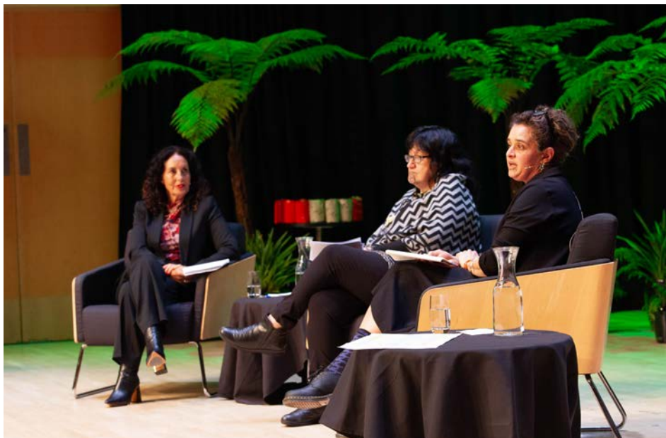
Image from Te Kāhui a Kiwa, conference, day one.

I'm reminded the last hui that we had, that kaihautū. We rearranged the lineup of kupu that originally was rights and interests, duties and responsibilities, and we flipped them, because rangatiratanga is about responsibilities and accountabilities and duties. So just want to thank you both, on behalf of all of us for all your mahi, and your lovely stimulating kōrero. Thank you very much.