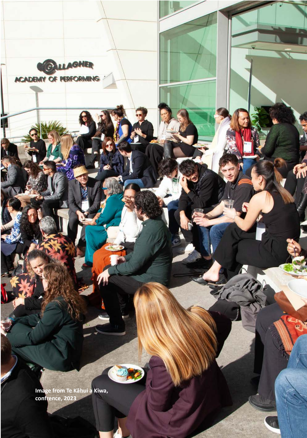
Image from Te Kāhui a Kiwa, conference, 2023