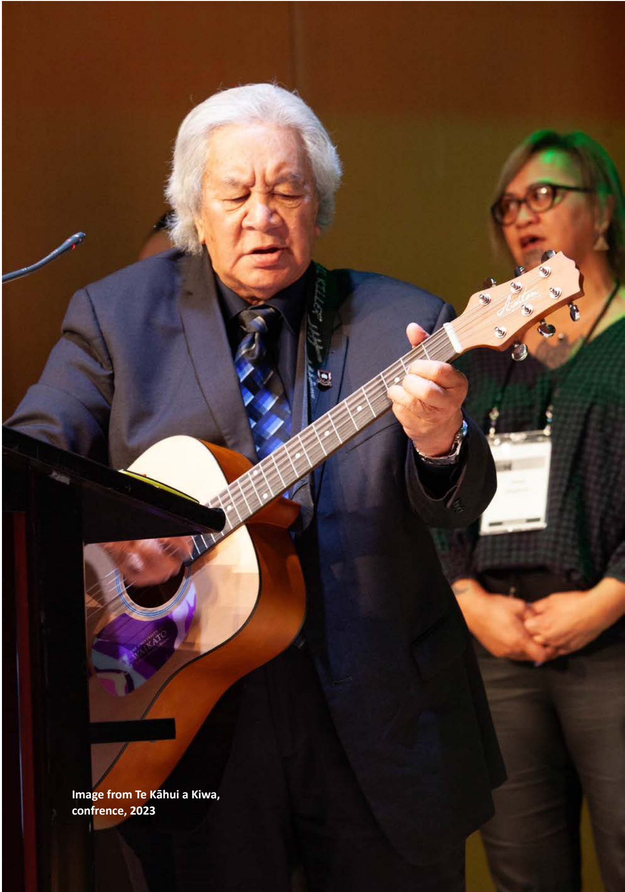
Image from Te Kāhui a Kiwa, conference, 2023