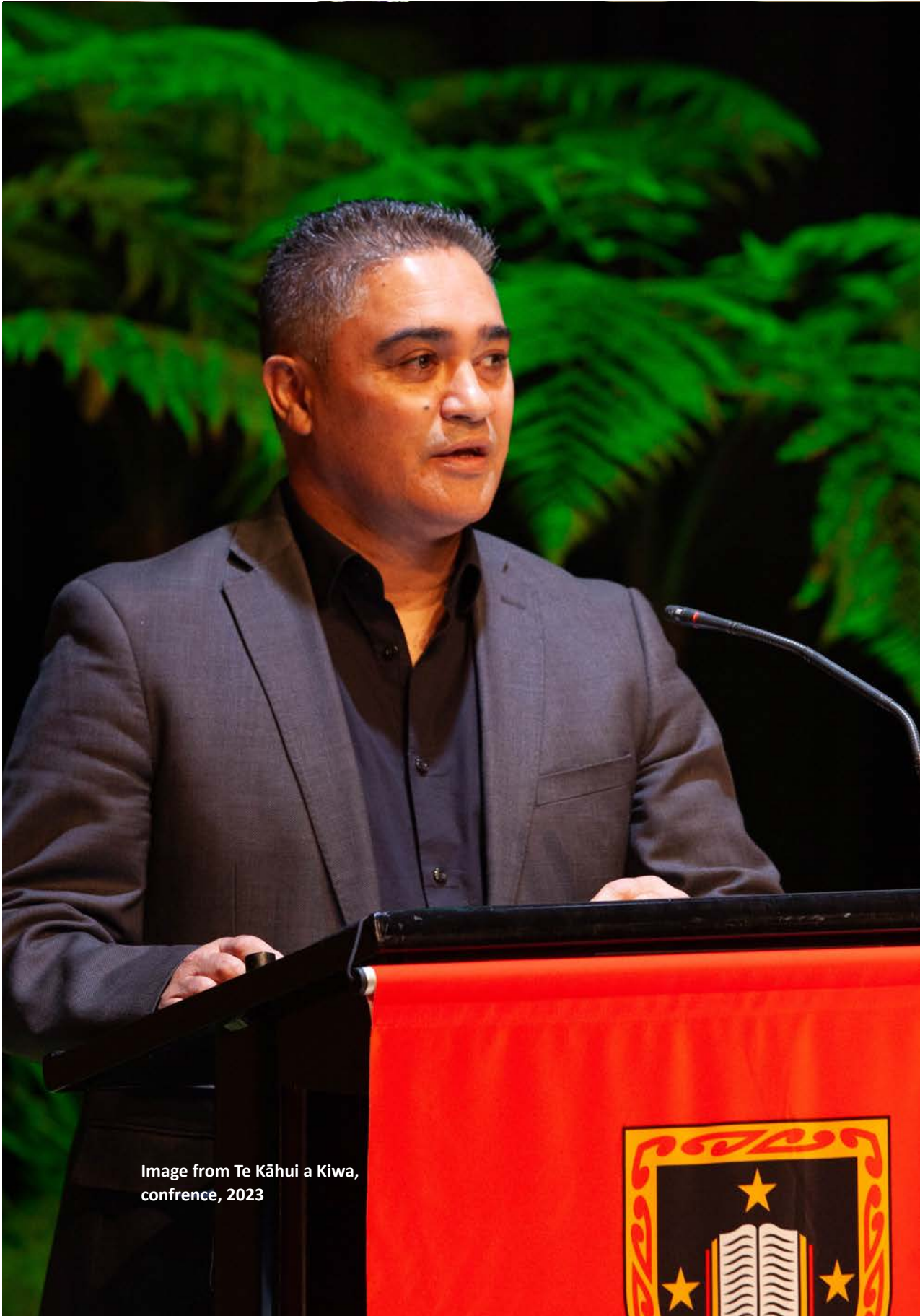
Image from Te Kāhui a Kiwa, conference, 2023