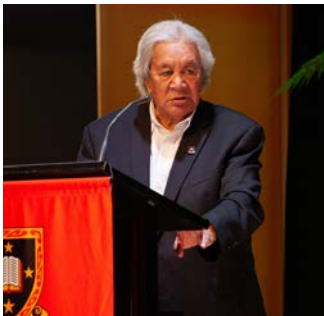
Image from Te Kāhui a Kiwa, conference, day one.

right at the beginning of a conference, it's mana enhancing behaviour when the MC says something funny that you laugh. I'm not asking for a Caucasian laugh, I'm asking for a bellowing, hearty Māori laugh when I say something funny.