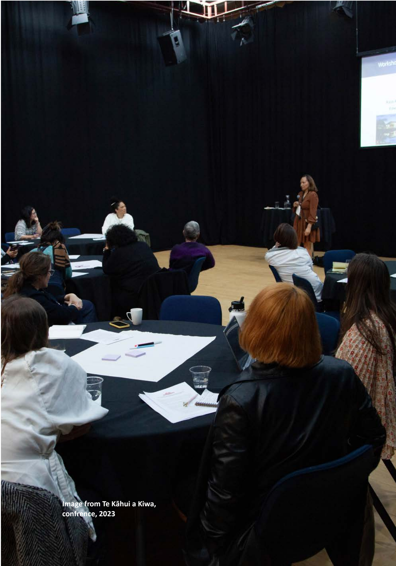
Image from Te Kāhui a Kiwa, conference, 2023