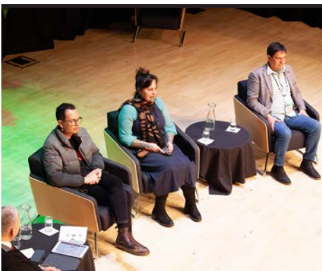
Image from Te Kāhui a Kiwa, conference, day two.