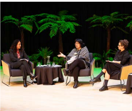
Image from Te Kāhui a Kiwa, conference, day one.

So, get off the fence, it's far too crowded, take a chance now, scream and shout it.