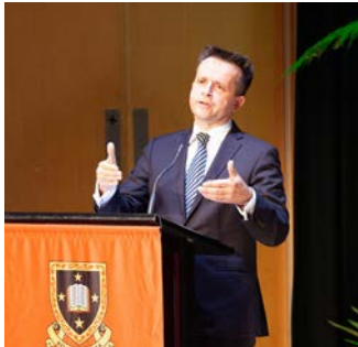
Image from Te Kāhui a Kiwa, conference, day two.

that we're looking to progress. I also want to talk about some of the things that we have changed. I want to talk specifically about the way in which we assess trade agreements. There is today, or it may even have been put up yesterday, a new working paper on an assessment of the CPTPP according to a new way of undertaking that assessment. I want to talk a little bit about that. I also want to talk briefly about what we have done and how we are changing as an organisation. I won't say changed, I'll say changing, because it is an evolving process in my organisation and my group and it's good to see lots of my staff here today as well. Those are three areas I want to cover.