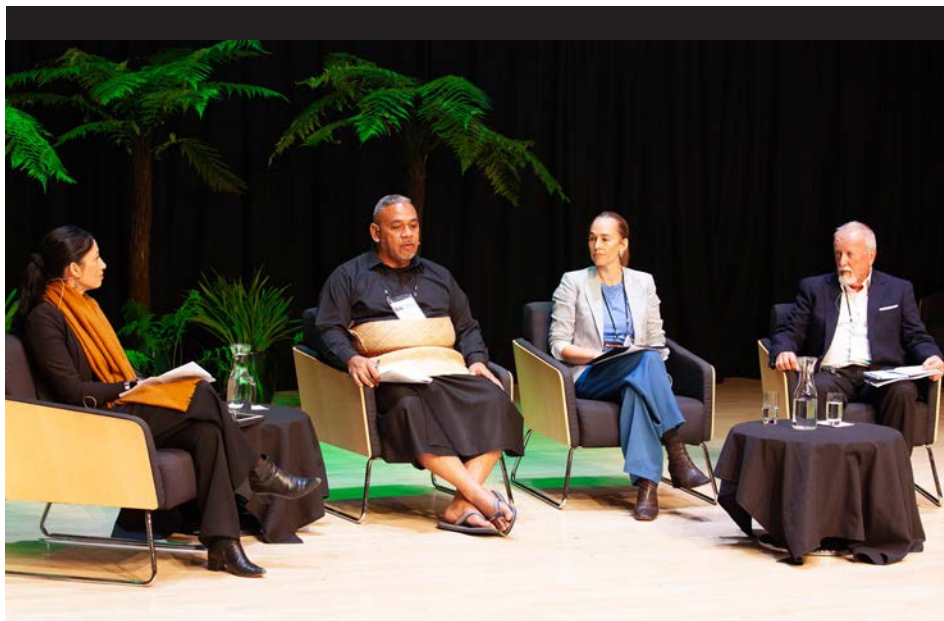
Image from Te Kāhui a Kiwa, conference, day two.